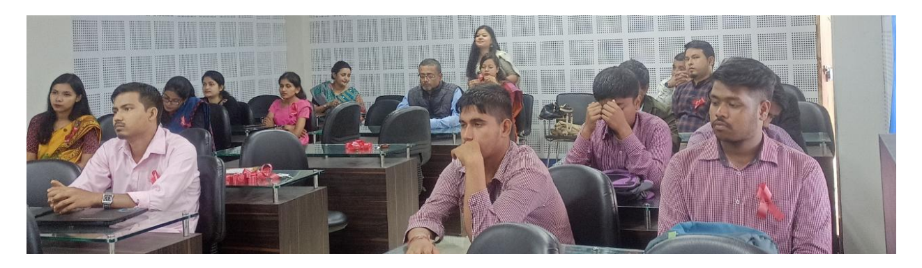
Figure 4: Participants during the talk