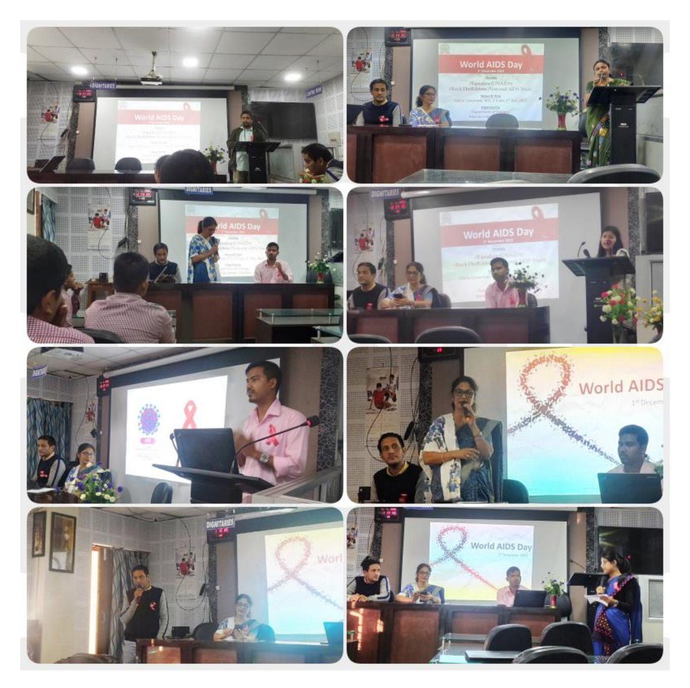
Figure 3: Few glimpses of the event