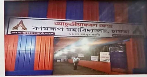
কামৰূপ মহাবিদ্যালয়ৰ আত্মতীয়াকৰণ কেন্দ্ৰ