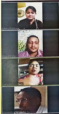
আলোচনী সম্পৰ্কত অনলাইন