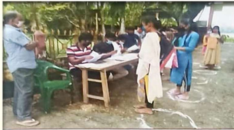
সামাজিক দূৰত্ব বজাই বাখি নামভৰ্তি প্রক্রিয়া

The Girls' Hostel of Kamrup college, Chamata was used as the Covid Quarantine Centre by Nalbari District Administration in the year 2020. As a part of institutional social responsibility, the Girls' Hostel was used as quarantine centre where more than two hundred people stay isolated in the hostel. Besides, sanitisation of college campus free Covid testing, Covid Awareness programme etc. by the college.