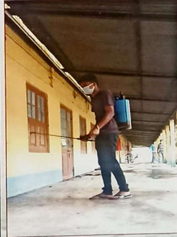
মহাবিদ্যালয়ত চেনিটাইজ কৰাৰ মুহূৰ্ত