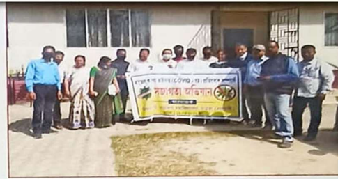
অধ্যাপক-অধ্যাপিকাব সজাগতা অভিযান