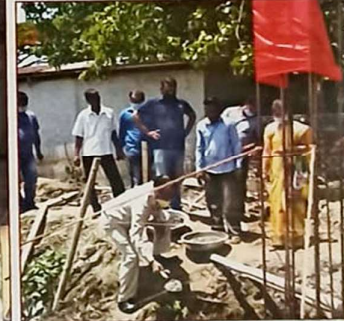
'RUSA' অধীনত নব গৃহৰ শুভাৰম্ভ